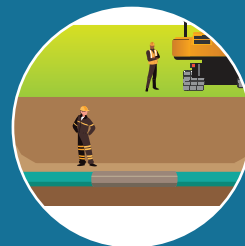
Hi-Grade Steel & Protective Coatings

Source: Liquid Energy Pipeline Association (LEPA)