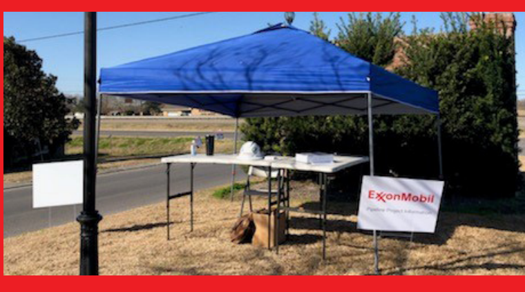
An ExxonMobil Pipeline Company mobile information kiosk available for residents in Antonia Plantation Estates during certain construction phases.

ExxonMobil Pipeline Company respects the communities in which we work. While we continue our project operations in West Baton Rouge, be on the lookout for mobile information kiosks where residents can speak with ExxonMobil Pipeline representatives. We're available to answer questions and provide relevant information about our ongoing work. For upcoming dates on booth locations visit batonrouge.exxonmobilpipeline.com/project-updates.