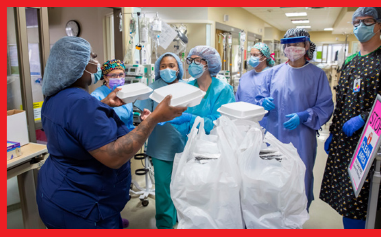
Food from local restaurants being delivered to hospital workers as part of the Fueling the Fight program.

In 2020, ExxonMobil joined Entergy Louisiana, Blue Cross and Blue Shield of Louisiana Foundation, Humana and Louisiana Mid-Continent Oil and Gas Association Foundation to set up Fueling the Fight Fund at the Baton Rouge Area Foundation. Together they contributed nearly $300,000 to the charitable account. ExxonMobil also supported local relief efforts by reimbursing the cost of fuel to Baton Rouge emergency response vehicles and providing gas gift cards to healthcare workers at Our Lady of the Lake, Baton Rouge General and Ochsner Health.