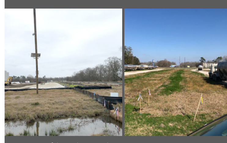
Crews safely work on pipeline construction projects throughout West Baton Rouge.