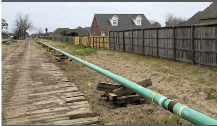
ExxonMobil Pipeline crews working on pipeline installation near the Antonia Plantation Estates subdivision in Brusly, Louisiana.

To learn more about current projects in your area, visit our website at batonrouge.exxonmobilpipeline.com/project-updates.aspx.