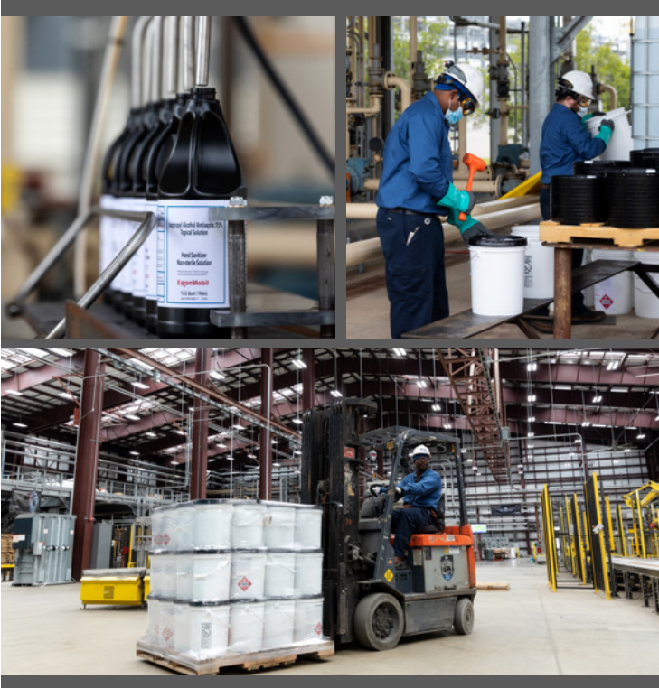
The locally made hand sanitizer is proudly produced in West Baton Rouge.

To read the full story and learn about other initiatives ExxonMobil is taking to help communities visit www.energyfactor.exxonmobil.com.