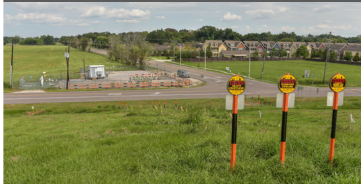
ExxonMobil Pipeline Company crews began the process of replacing pipeline segments in Ascension, East Baton Rouge, Iberville and West Baton Rouge parishes.

To learn more about current projects in your area, visit our website at batonrouge.exxonmobilpipeline.com/project-updates.aspx .