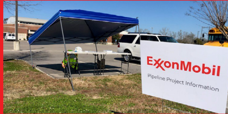
An ExxonMobil Pipeline Company mobile information kiosk available for residents at the St. Gabriel Community Center to answer any questions about project work.

ExxonMobil Pipeline Company respects the communities in which we work. While we continue our project operations in East Baton Rouge, be on the lookout for mobile information kiosks where residents can speak with ExxonMobil Pipeline representatives. We're available to answer questions and provide relevant information about our ongoing work. For upcoming dates on booth locations visit batonrouge.exxonmobilpipeline.com/project-updates .