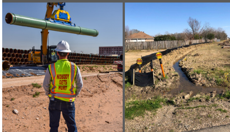
Crews safely work on pipeline construction projects throughout East Baton Rouge.