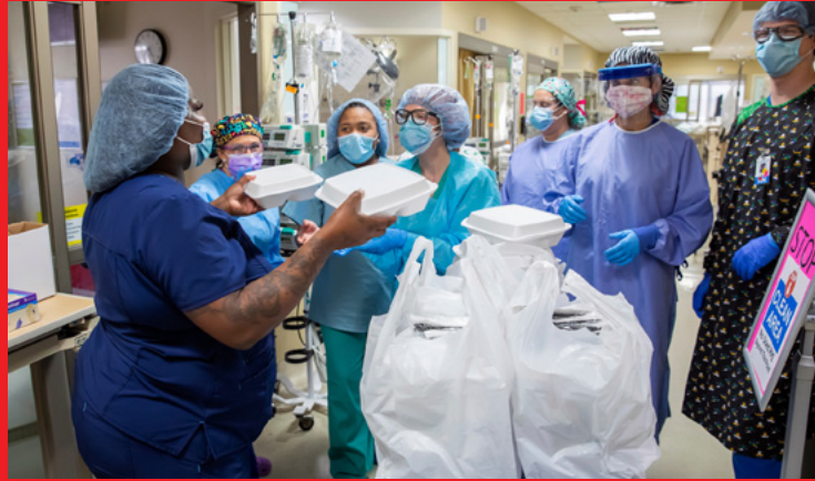
Food from local restaurants being delivered to hospital workers as part of the Fueling the Fight program.

ExxonMobil is dedicated to continuing our efforts supporting our local communities, advancing educational opportunities for students and serving as a resource for emergency response personnel.